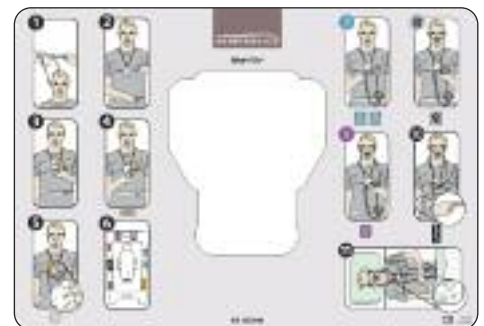
Easy reference diagram