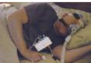
Accommodates side sleepers